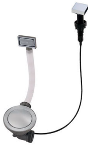
Space automatic waste fitting - PA 8407 108