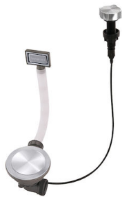
Space Milano automatic waste fitting 8407 115