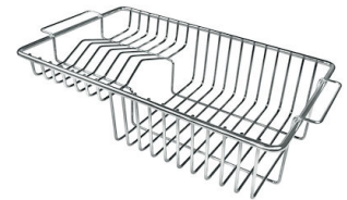
Stainless steel plate rack 8100 201