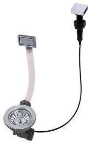
Automatic waste fitting - PM 8407 113