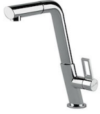
Mixer Tap KE 8492 000