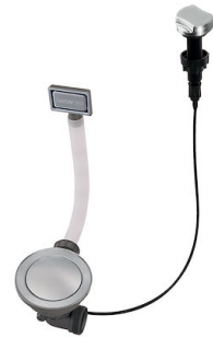
Space automatic waste fitting - PE 8407 109